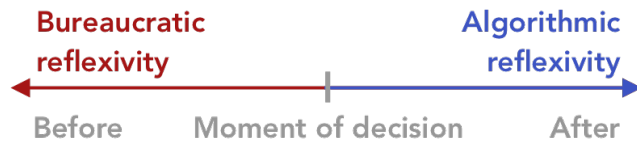
Figure 2: Bureaucrats can act reflexively before making the decision; algorithms, requiring feedback, can at best retrain and act reflexively after the decision.

nudity came under scrutiny in 2008 when mothers protested action taken against pictures of them breastfeeding [30]. Facebook adjusted its moderation policies to allow nudity in the case of breastfeeding, but its moderation team then was faced with myriad new marginal and novel cases. For example, when faced with new examples, they needed to decide: is it breastfeeding if the baby isn’t actually eating? What if it’s not a baby, but instead an older child, an adult, or an animal that’s at the breast? These interpretations had to be developed to handle these cases as soon as they arose on Facebook. In contrast, today Facebook uses algorithms to detect nudity. For several of these classes of photos, the pre-trained algorithm makes a decision guided by the data that informed it and, in accordance with its training, it removes the photos. As a street-level algorithm, the system made its decision ex ante and executed its decision according to the decision boundary that it generated. Facebook’s moderation team, in contrast, made the decision ex post , debating about the implications of each option, the underlying rationale that would corroborate their intuition for whether it should be allowed, and what their boundary should be.